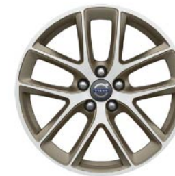
Modin, 8x18" Diamond Cut/Matte Terra Bronze