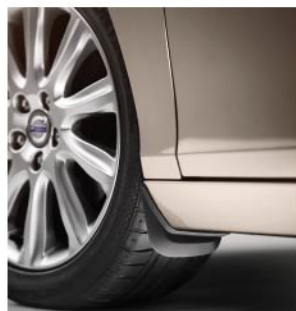
Mudflaps Front & Rear