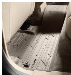
Passenger Floor Mat - Textile