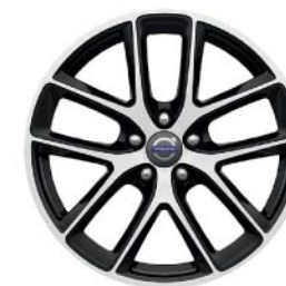
Modin, 8x18" Diamond Cut/Glossy Black