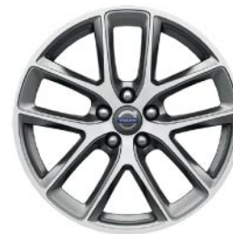
Modin, 8x18" Diamond Cut/Matte Iron Stone