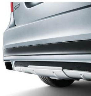
Skid Plate Rear