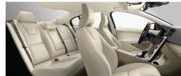
3112 Soft beige in beige interior with beige headlining