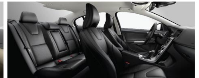
3101 Off black in black interior