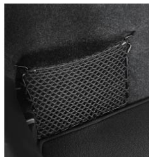
Load Compartment Net Pocket