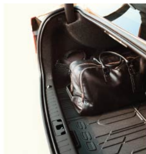
Cargo Compartment Mat - Textile/Plastic