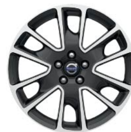
Freja, 8x18" Diamond Cut/Matte Dark Grey