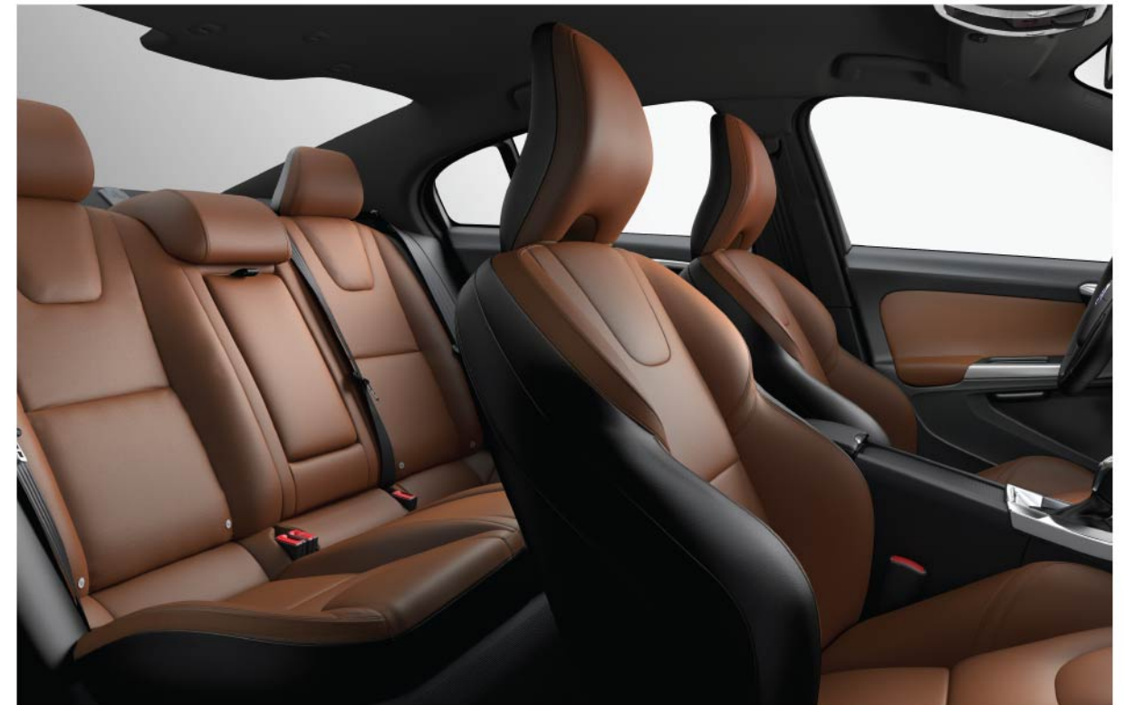
3363 Beech wood brown/off black in black interior with charcoal headlining - Sports Leather