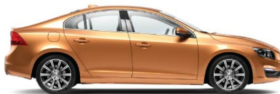
Vibrant Copper Metallic