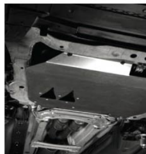
Engine Protective Plate