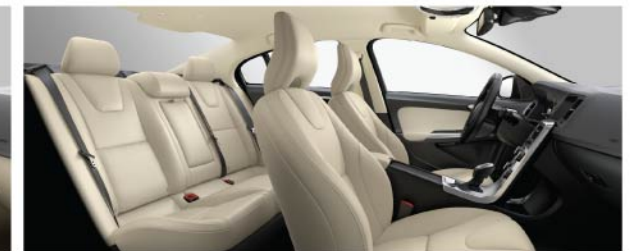
310P Soft beige in black interior with soft beige headlining