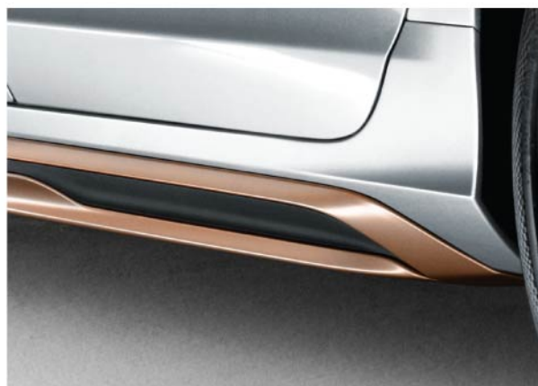
Side Scuff Plate