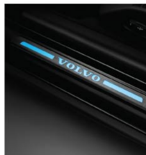
Illuminated Sill Moulding