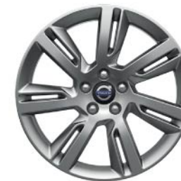
Sleipner, 8x18" Black Chrome