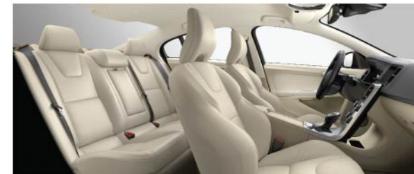
3312 Soft beige in Sandstone beige interior with soft beige headlining - Sports Leather