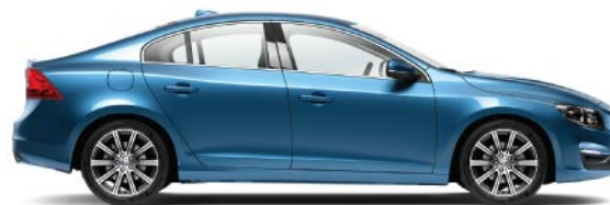
Power Blue Metallic