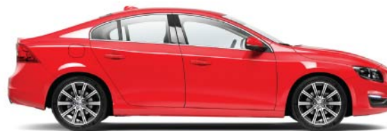
Passion Red Solid