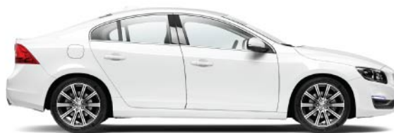
Crystal White Pearl Metallic