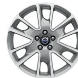
Freja, 8x18" Diamond Cut/Light Grey